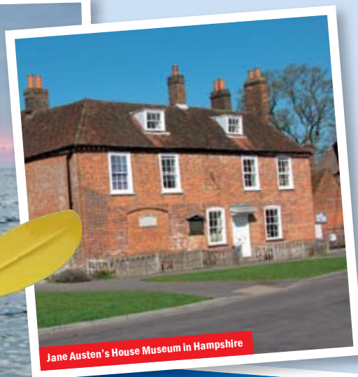
Jane Austen's House Museum in Hampshire