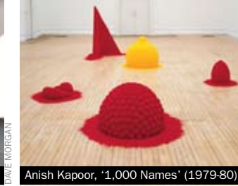
Anish Kapoor, '1,000 Names' (1979-80)