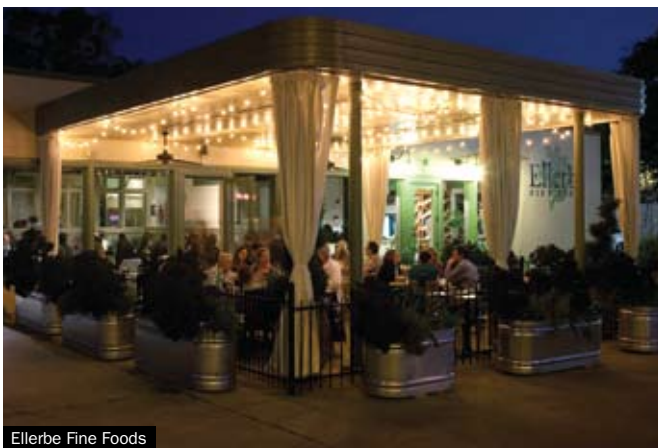
Ellerbe Fine Foods

recent years with new bars, cafés and restaurants in converted buildings along Magnolia Avenue. Located in a former gas station, Ellerbe Fine Foods offers farm-to-table cuisine in a unique setting: 'patio' dining is where petrol bowlers once were. 1501 W Magnolia Ave, Fort Worth. +1 817 926 3663. www.ellerbefinefoods.com . Across the road, you'll find the best Hemingway Daiquiris in town at The Usual and a couple of food trucks parked out the back. 1408 W Magnolia Ave, Fort Worth. +1 817 810 0114. theusualbar.com .