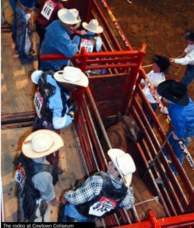
The rodeo at Cowtown Coliseum