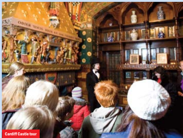
Cardiff Castle tour