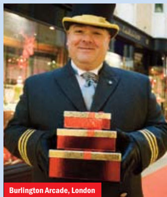
Burlington Arcade, London