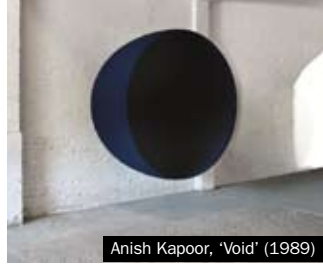
Anish Kapoor, 'Void' (1989)

For more things to do this month timeout.com/sydney