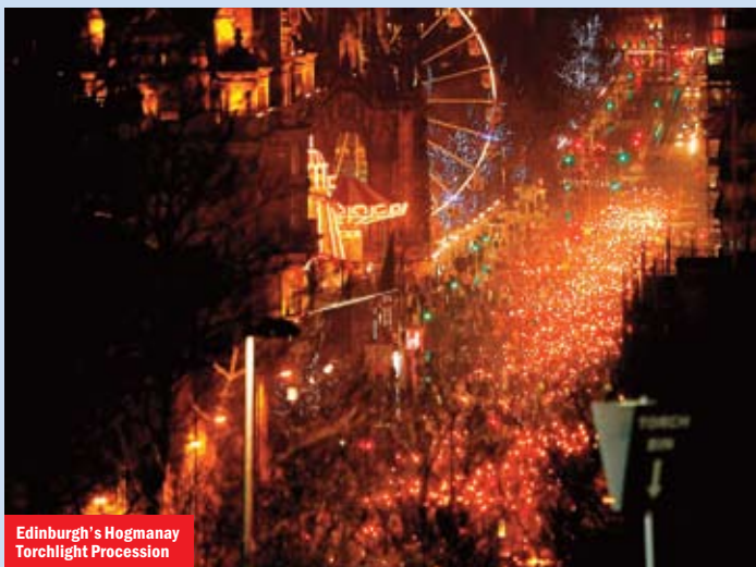
Edinburgh's Hogmanay Torchlight Procession