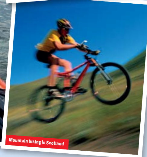
Mountain biking in Scotland