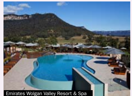
Emirates Wolgan Valley Resort & Spa

Once a mining village, Katoomba is now a boomtown of rejuvenation. The Carrington Hotel (15-47 Katoomba St, Katoomba 2780,