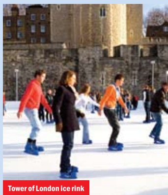
Tower of London ice rink