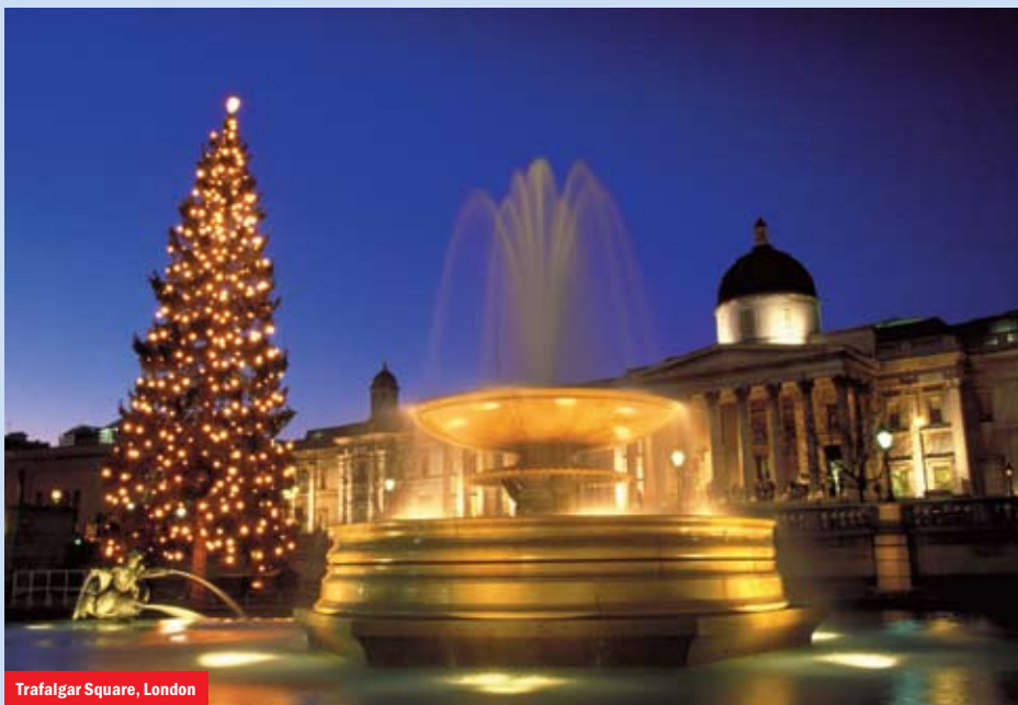
Trafalgar Square, London