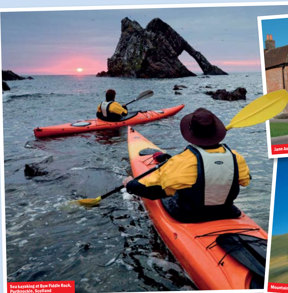
Sea kayaking at Bow Fiddle Rock, Portknockie, Scotland