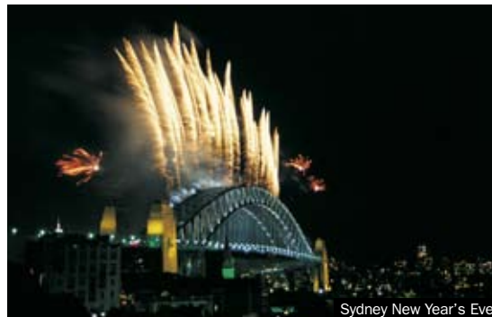
Sydney New Year's Eve

Sydney in summer is hot to trot with music, art, dance, theatre, opera, illumination ...and fireworks from Kylie