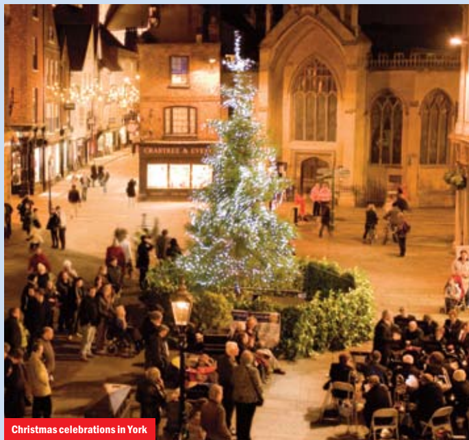
Christmas celebrations in York

In Edinburgh, Scotland, one of Europe's largest open-air rinks is in East Princes Street Gardens (Nov 24-Jan 4, www.edinburghchristmas.com ) and in Brighton on the south coast of England, visitors can round off a day's shopping in the boutiques of the Lanes by heading for the ice rink in front of the splendid Royal Pavilion palace. Celebrity chef Jamie Oliver provides Fabulous Feasts, a rinkside bar-restaurant (Nov 10-Jan 20, www.royalpavilionicerink.co.uk ).